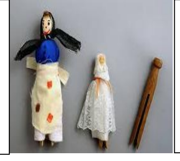
Design and technology