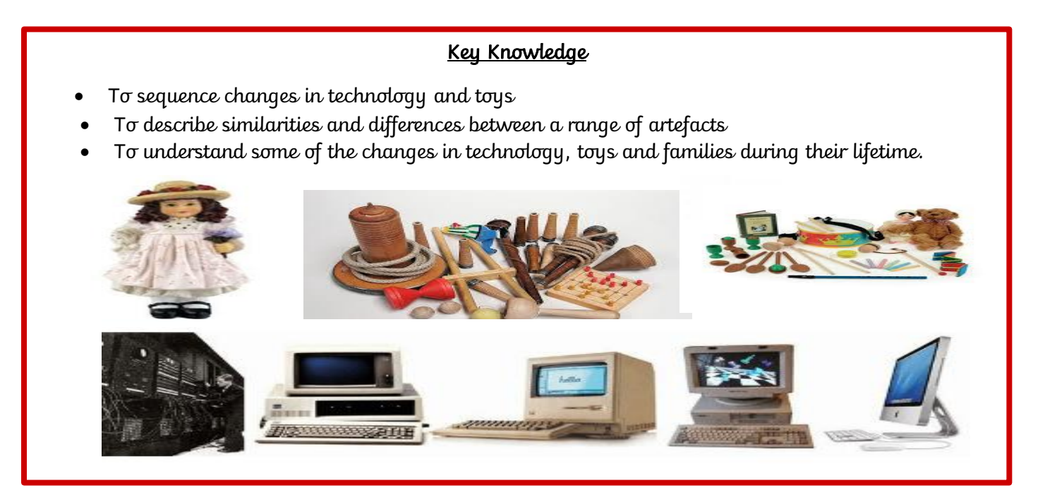
Key Art and design and design and technology knowledge we will gain from this unit.