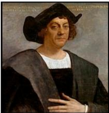
Christopher Columbus 1451-1506