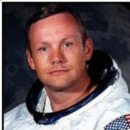
Neil Armstrong 05 Aug. 1930 - 25 Aug. 2012

"That's one small step for man, one giant leap for mankind."